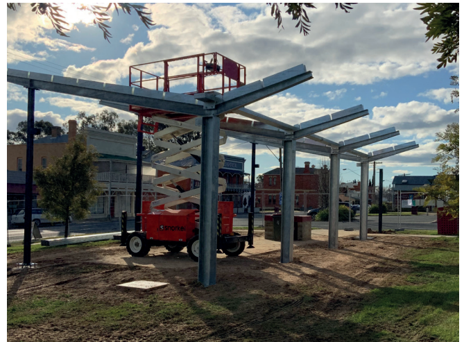
Construction of the Avoca BBQ Shelter in High Street is going well.

In the meantime we're edging closer to awarding the contract for the new playground. Tenders are being evaluated and we'll let you know when construction will begin. This new all inclusive play space will enhance play opportunities for children in the town. It will be entirely fenced so children will be able to play to their heart's content. The location will also hopefully encourage visitors to stop in the town and spend more time (when they are allowed to of course!).