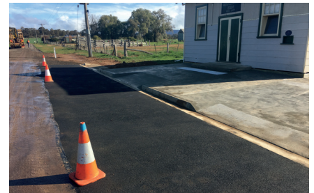
Better access to the Moonambel Hall.

Trees will be planted in Beaufort, Raglan and Moonambel, and new footpaths in various towns across the shire are also part of the program. $100,000 has been allocated to town improvements which were identified in the Pyrenees Futures program.