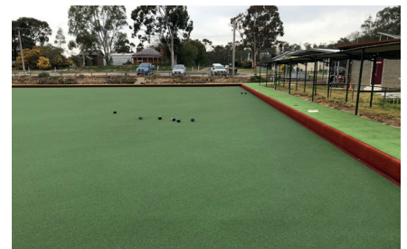
The new synthetic turf at the Avoca Country Golf Bowling Club, a project completed under the Drought Communities Program.