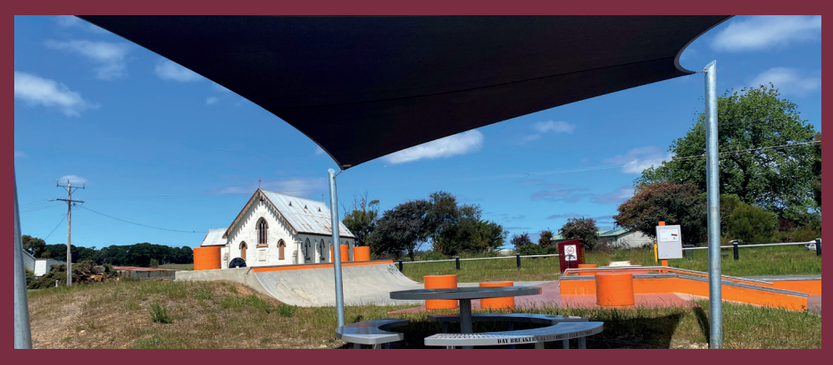
The new shade sail at the Snake Valley Skate Parks was funded in part by a Pyrenees Shire Community Grant.

Cr Eason credited the large number of grant applications to Council recognising the challenges created by the global pandemic and increasing the size of grants and changing the eligibility criteria to make it easier to apply. In addition, Council created a special Youth grant to support young people.