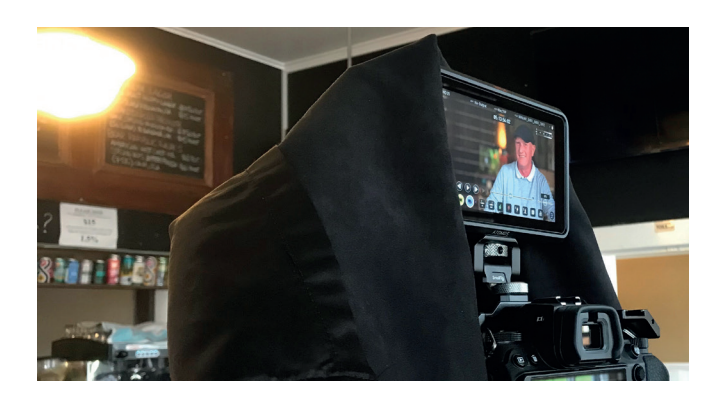
Avoca Hotel's Ian Urquhart was one of the eight local people who participated in the video.

If you would like to view the video, you can do so via Council's YouTube channel. We also plan to display it on the Pyrenees Projector in Beaufort.