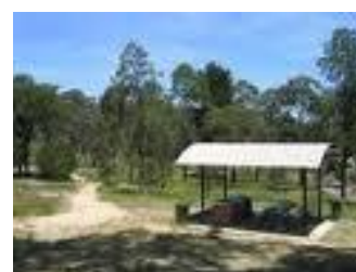
Camp Hill Picnic Area Beaufort