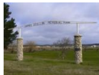
James Scullin Memorial Park Trawalla