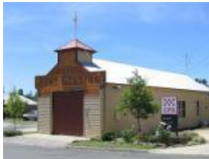
Beaufort Fire Station