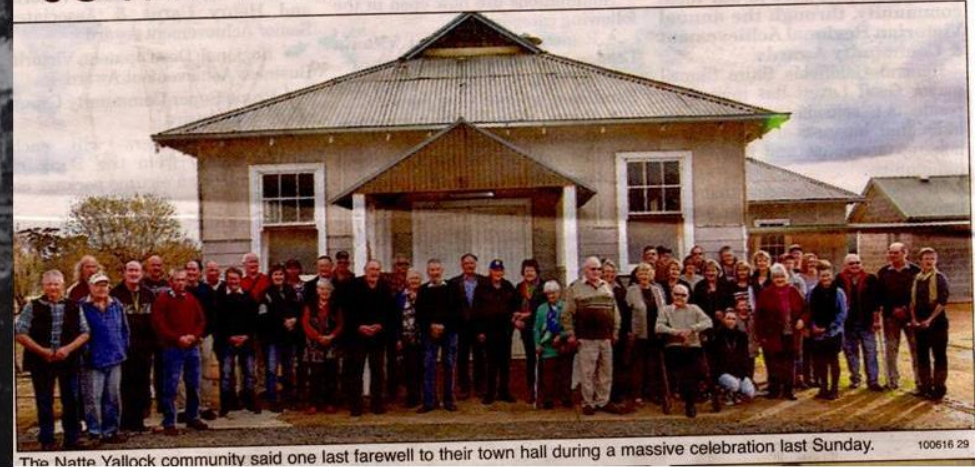
The Natte Yallock community said one last farewell to their town hall during a massive celebration last Sunday. 100616 29