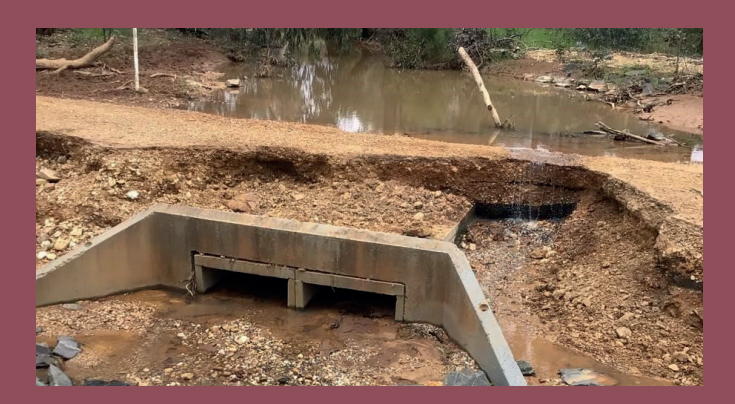
Susan's Lane in Percydale was among the roads severely damaged during the floods.

Updates on infrastructure repairs can be found on our website pyrenees.vic.gov.au/flood-updates and if you need help with any aspect of flood-recovery you can contact the Flood Recovery Team on 1300 797 363 or email recovery@pyrenees.vic.gov.au.