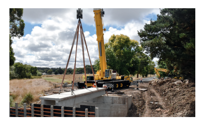
A crane lowers the deck into place on Bridge 139 on the Raglan-Elmhurst road.