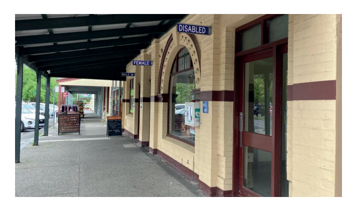
Work on the Havelock Street toilet block refurbishment is due to start next month.

This work is part of Council's building renewal program including public toilet blocks recently replaced at Amphitheatre, Waubra and Beggs St, Beaufort.