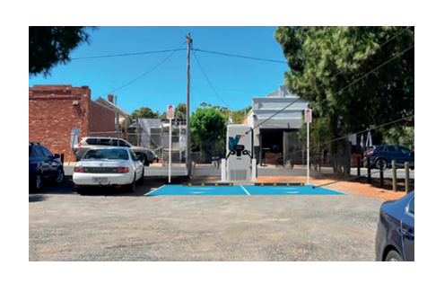
Artist's impression of the planned EV charging station in Avoca.

Council aims to have both charging stations installed and operating by the end of June 2023.