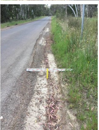
Shoulder works on Old Shirley Road in Beaufort