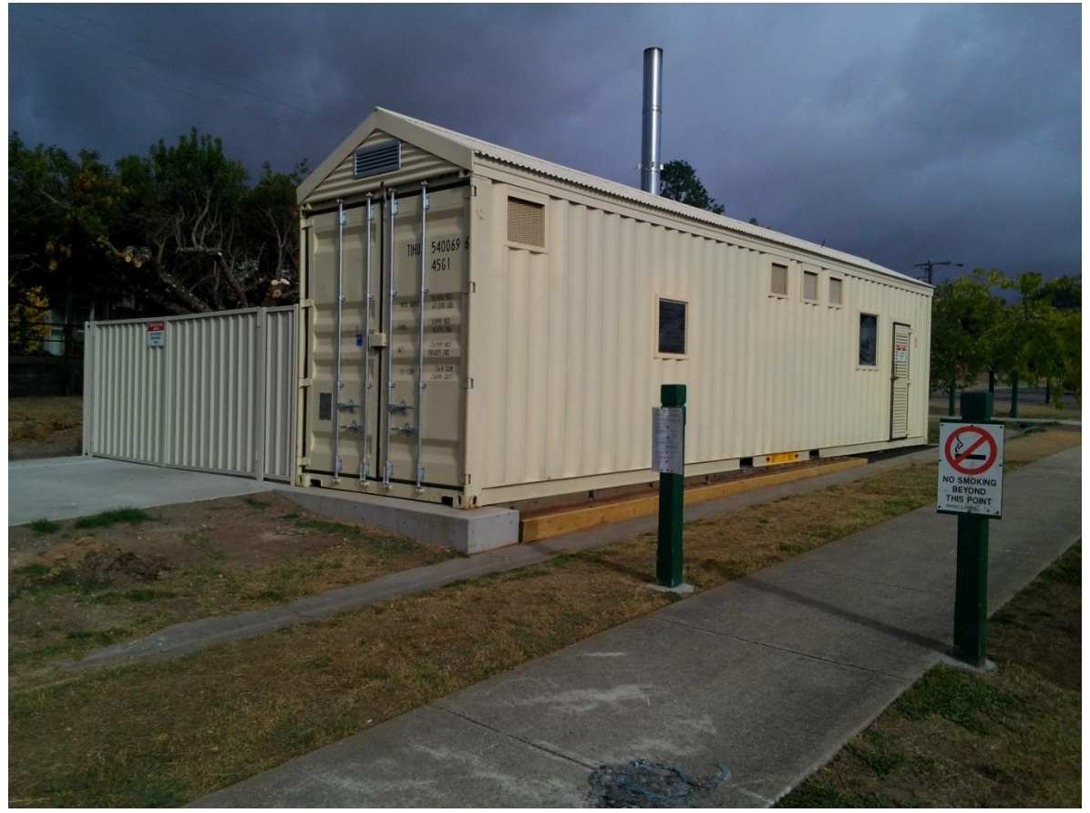
Figure 2: Boiler house and fuel store

The financial benefit is estimated as a simple payback of 12 years and the project will provide a reduction in hospital operating costs.