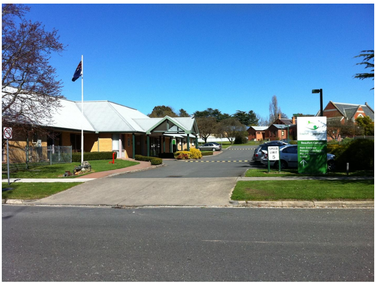
Figure 1: Beaufort Hospital

A wood chip fired boiler system has been installed at the Beaufort Hospital (Figure 1) as a demonstration project for bioenergy. The 110kW Hargassner boiler supplied by Living Energy is housed in a 12.0 metre shipping container which also includes a fuel store and filling system. The system will take over most of the heating load from the existing LPG system and had an installed cost of $438,937. The existing LPG boilers will be retained as backup and to cover peak loads. It is expected to reduce expenditure on LPG by around $55,350 per year with overall heating costs being reduced by $34,966 per year. The simple payback on the installation is expected to be 12 years at current LPG prices. This could be less if LPG prices rise.