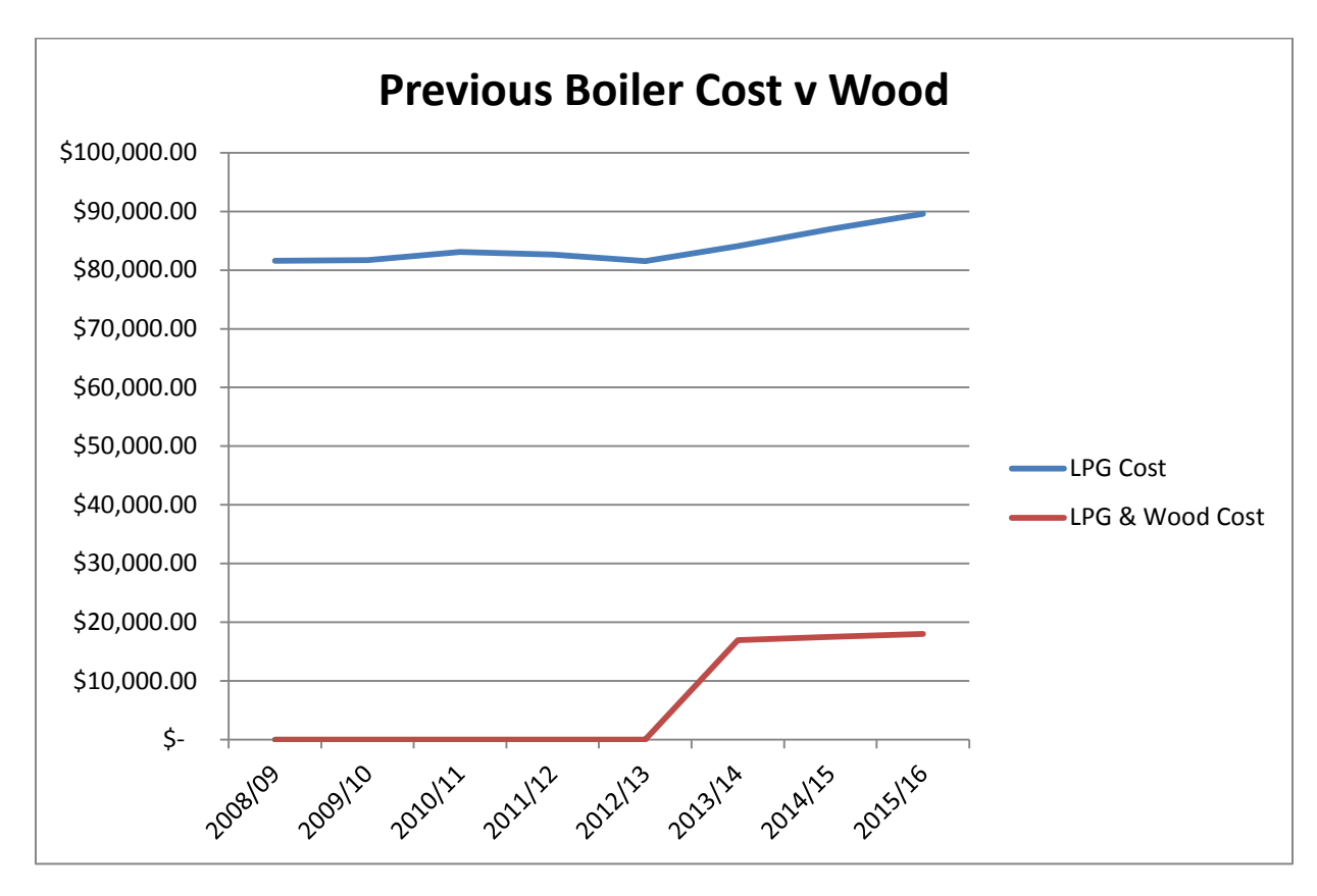
Figure 3: Previous Boiler Fuel Costs with LPG and Wood Chip Fuels