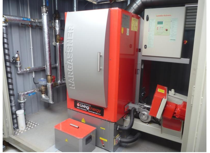
The boiler unit inside the container

Other activities for the project include completing the Horsham Aquatic Centre heating study. The study has identified potentially significant savings on heating costs by using wood waste to heat the indoor pool. Once completed, it will be presented to Horsham Rural City and other Wimmera councils. The study considered other potential fuels include grain waste and municipal green waste.