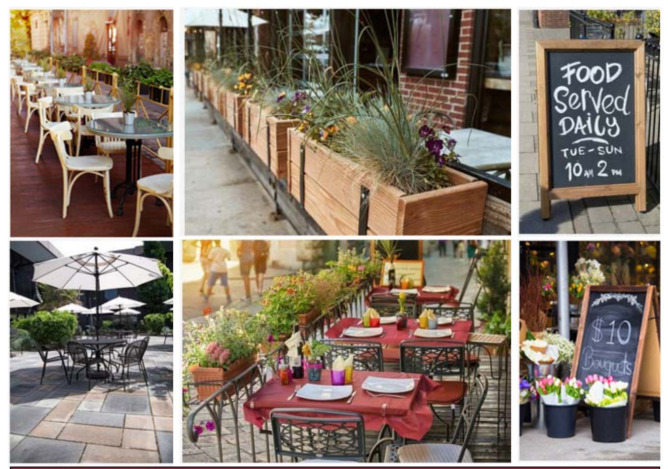
What activities do you want a permit for? Please tick all that apply

All footpath trading permits are for 12 months and due for renewal on 30<sup>th</sup> September each year.